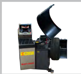
BLUE LIGHT - BMW