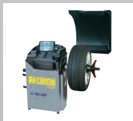
EM7240 - VAS 6587