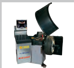
BLUE LIGHT - VAS 6589