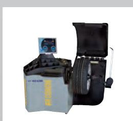
EM740 - VAS 6588