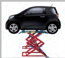
ERCO 301 TY